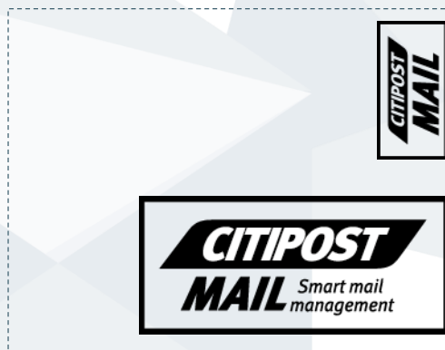
Customer access indicator